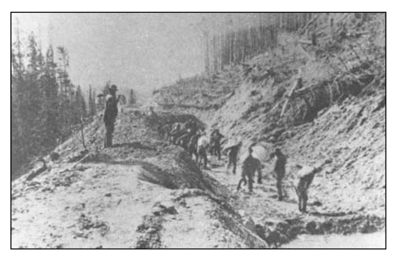
Figure 1. Japanese and Mexican workers dug mile after mile of the Grand Ditch using only picks and shovels (circa 1904).

Between 1880 and the early 1930s, water users on the Front Range turned to ditch companies and other private entities for the development of transmountain diversion projects.<sup>14</sup> Like the Larimer County Ditch Company (which eventually sold its rights in the Grand Ditch to the Water Supply & Storage Company), farmers and other agricultural interests were the main force behind many of these early projects.<sup>15</sup> Similarly, in 1917 a group of farmers in the Arkansas River Basin formed the Twin Lakes Reservoir and Canal Company, for the purposes of building and operating the Independence Pass